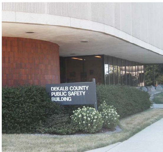
Exterior of the Existing Facility

Through meetings with the DeKalb County Sheriff and his staff, the team generated a report to address the building needs of the Jail and other related building space.