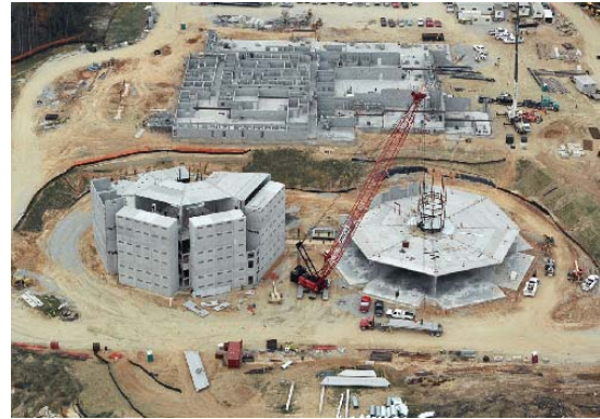
Beginning of construction. The seven-story project is now nearing completion.