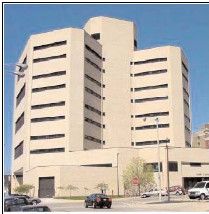
Exterior of the Existing Facility