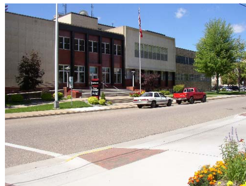
Exterior of Existing Courthouse